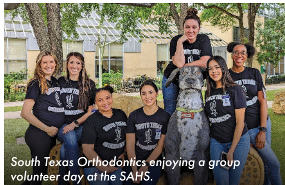
South Texas Orthodontics enjoying a group volunteer day at the SAHS.

Calling all animal lovers and adventure seekers! Have you ever considered spending a day away from the office and looking for some fun? Well, look no further than the San Antonio Humane Society (SAHS)!