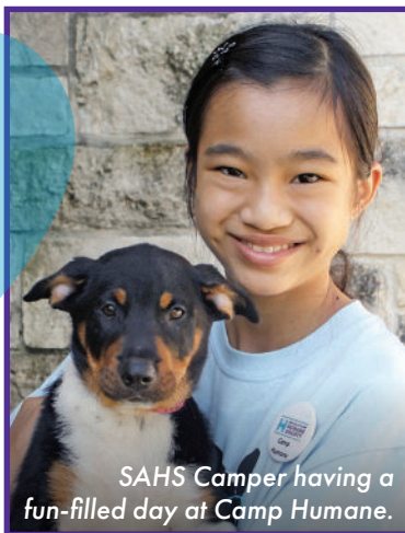
SAHS Camper having a fun-filled day at Camp Humane.