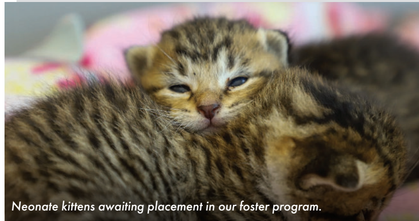
Neonate kittens awaiting placement in our foster program.