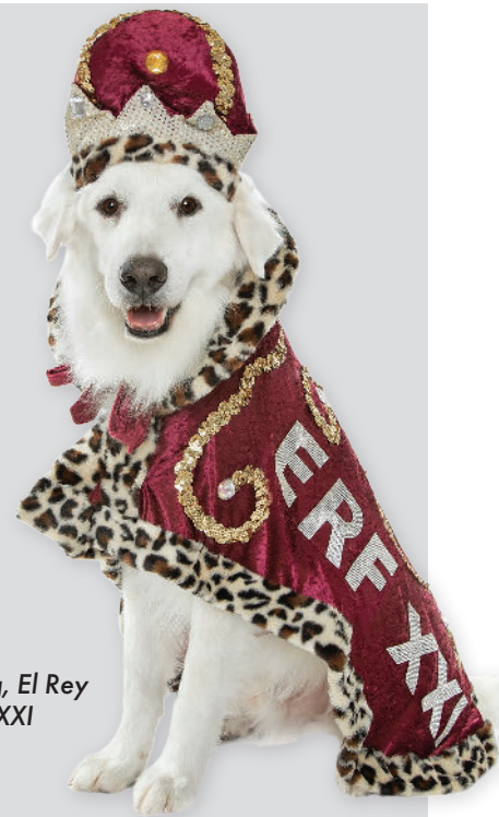
Flagg, El Rey Fido XXI

Sign up to join the ranks of Fiesta Royalty or learn more about the event at SAhumane.org/ERF .