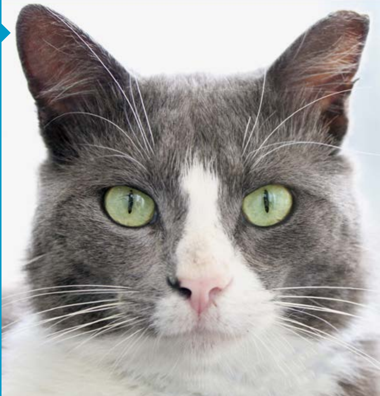
GABE, AVAILABLE FOR ADOPTION

MEET OUR COVER CAT, GABE! GABE IS A FRIENDLY AND ENERGETIC GUY WHO LOVES TO BE THE CENTER OF ATTENTION. HE LOVES TO PLAY AND GO EXPLORING, AS LONG AS A FRIEND IS CLOSE BY HIS SIDE. GABE IS ALSO ONE OF THE MANY SAHS SHELTER PETS FEATURED IN OUR 2012 ANNUAL REPORT, SO YOU COULD SAY HE'S KIND OF A STAR! A COPY OF THE 2012 SAHS ANNUAL REPORT IS NOW AVAILABLE AT OUR SHELTER OR ONLINE AT SAHUMANE.ORG. WE ARE VERY PROUD OF OUR MANY SUCCESSES IN 2012 AND ARE EXCITED TO SHARE THEM WITH YOU.