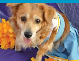
3 CHEERS FOR PAWS ON THE PATIO!