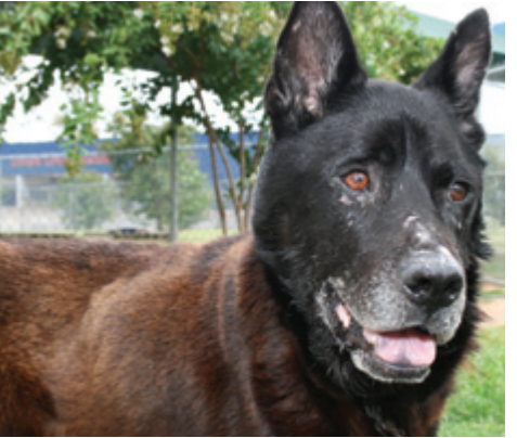
AFTER A FEW WEEKS IN OUR CARE