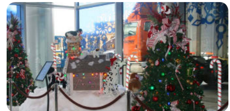
Pet Themed Holiday Window at Grand Hyatt San Antonio