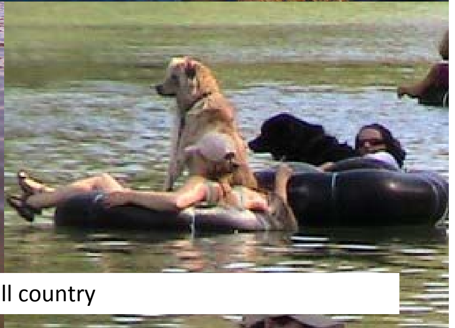
summer in the hill country