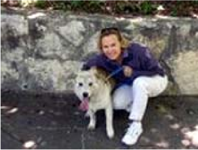
on the riverwalk