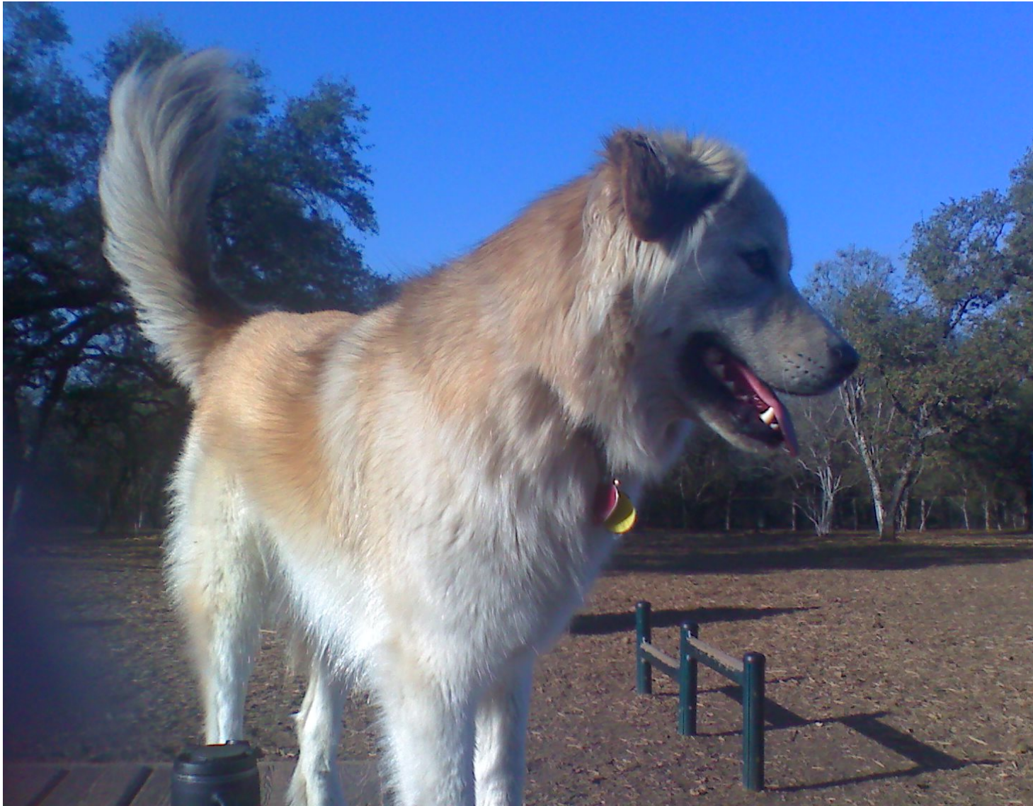
reigning over the dog park