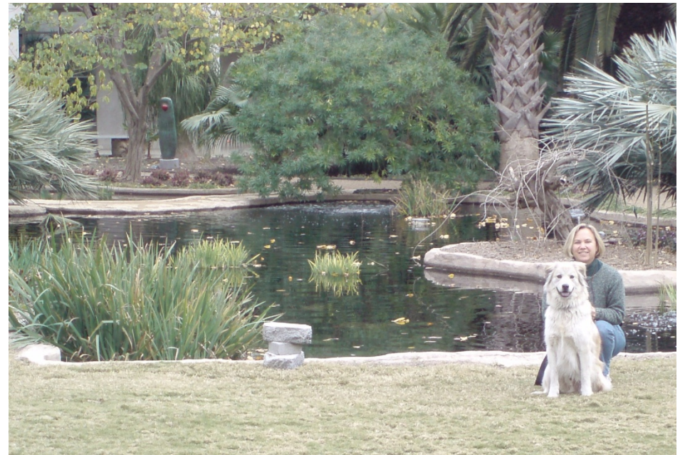
at the botanical garden