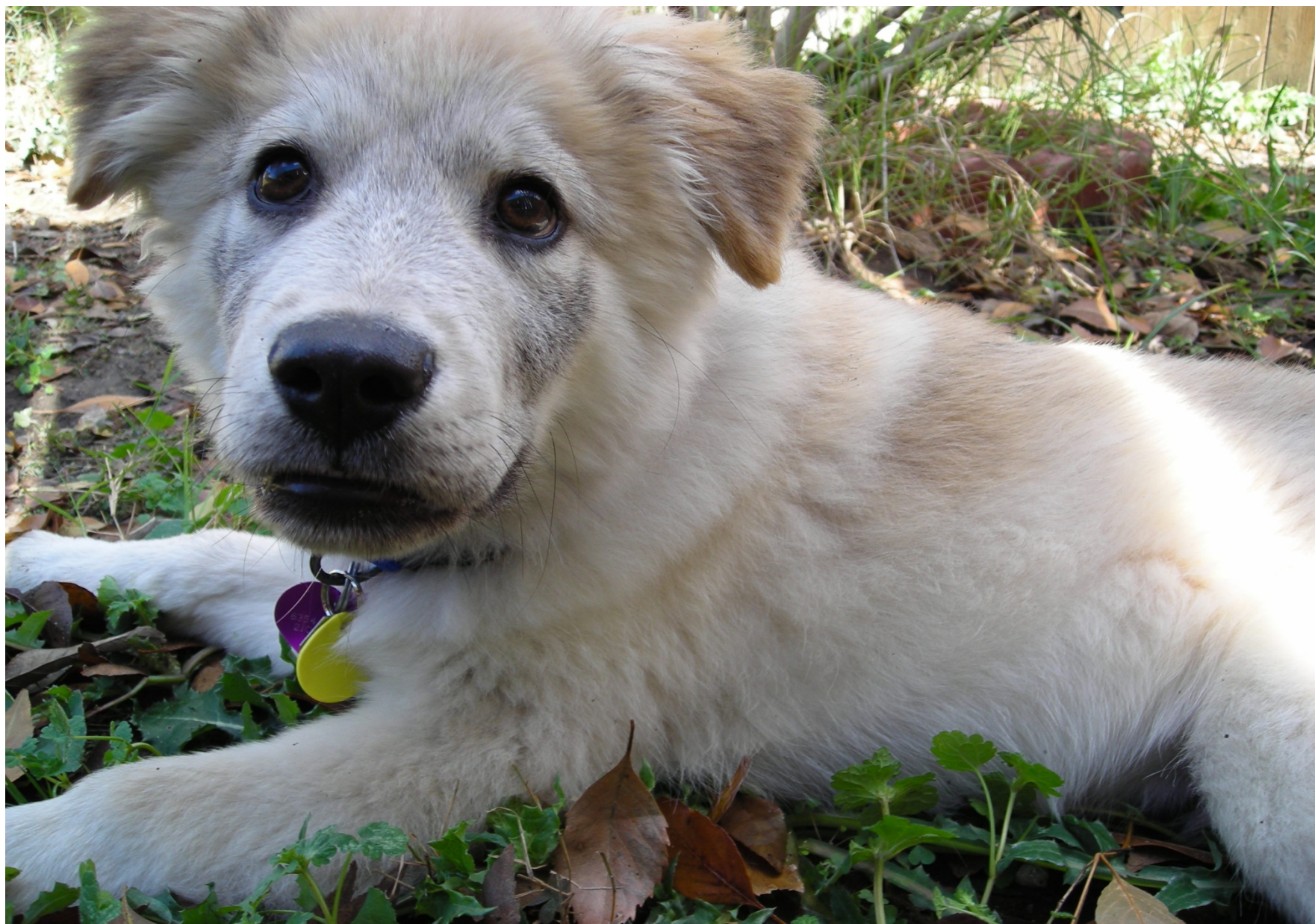
Bexar's first day with me