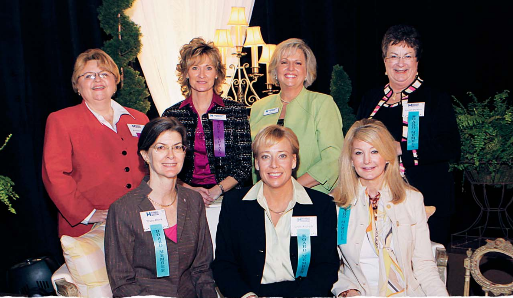
Humane Society Team