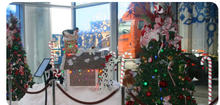
Pet Themed Holiday Window at Grand Hyatt San Antonio