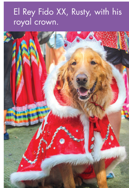
El Rey Fido XX, Rusty, with his royal crown.

Our El Rey Fido XXI competition is fast approaching, and we'd love to have you and your dog sign up to become a fundraiser! Learn more at SAhumane.org/ERF .