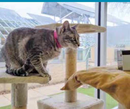
One of our sweet shelter cats listens intently as a Tales for Tails student reads aloud to her via a webcam.

The SAHS was recently named recipient of the Northside Independent School District's 2020-2021 Outstanding Partnerships Program Award for the Tales for Tails Reading Program!