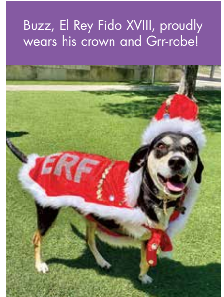
Buzz, El Rey Fido XVIII, proudly wears his crown and Grr-robe!

The 2020 El Rey Fido Royal Court raised over $32,800 for the dogs and cats at the SAHS. These royal pups include Buzz (El Rey Fido XVIII), Bella (Princess of the Food Bowl), Lady (Duchess of the Chew Toy), Chula (Duchess of the Fire Hydrant), and Lucy (Maiden of the Royal Court).