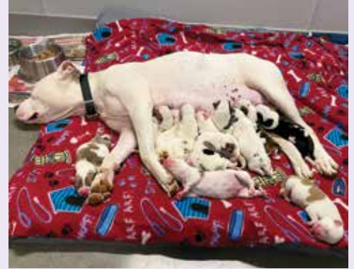
The 13 pups thrived under the care of Mama Tulip and their loving foster family.

Tulip arrived at the San Antonio Humane Society (SAHS) just in the nick of time — she was heavily pregnant with a large litter of puppies, and ready to give birth any day! Luckily, one of our dedicated foster families took her home, and within 48 hours, Tulip gave birth to 15 puppies. Unfortunately, two of the puppies did not make it, but 13 out of the litter grew into strong, feisty pups. Once they were ready, mama and babies returned to the SAHS, where they all very quickly found their forever homes.