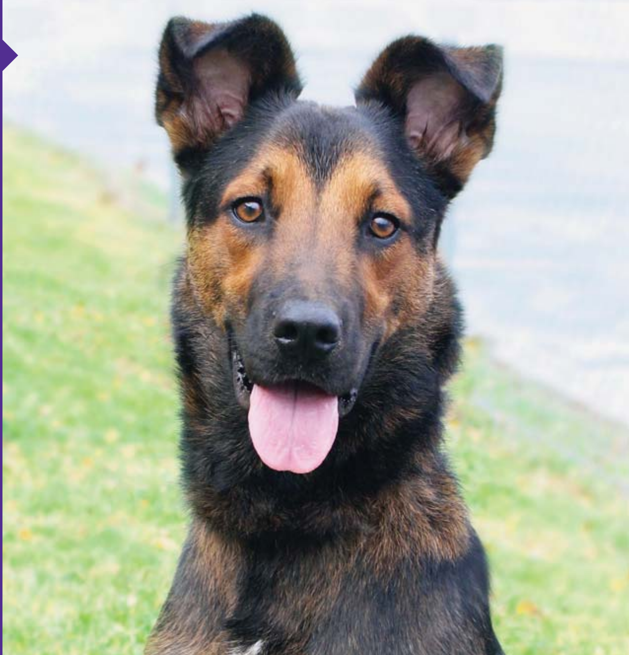
TANK, ADOPTED 12.22.2012