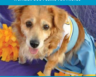
3 CHEERS FOR PAWS ON THE PATIO!