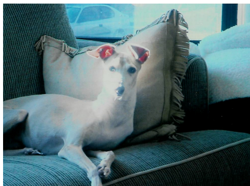
Niko lounging at his new Chicago home.

The Humane Society SPCA of Bexar County provided homes to over 6,000 orphaned animals in 2006. Your contributions to our organization help us care for these animals when they are in our care.