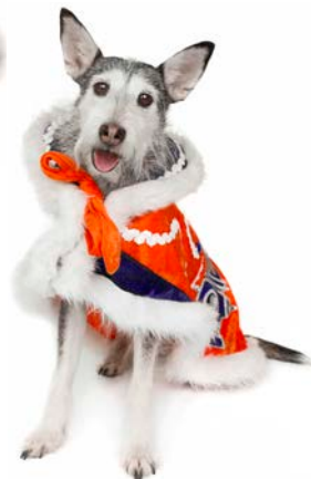
Duchess of the Ever Present Fire Hydrant, Arleigh