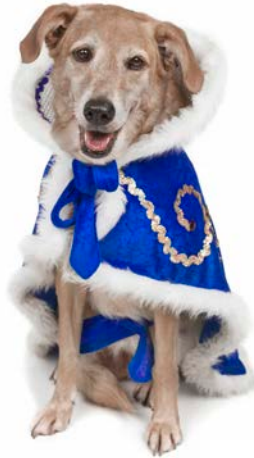
Princess of the Perpetual Food Bowl, Ethel