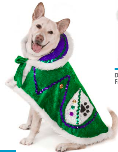
Knight of the Royal Court, Dakota