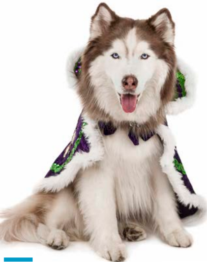
Duke of the Indestructible Chew Toy, Bellin