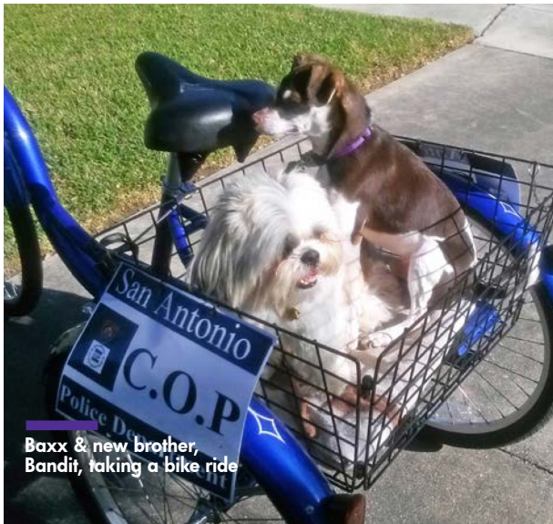
Baxx & new brother, Bandit, taking a bike ride