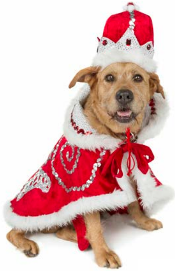
El Rey Fido XIII, Ruby