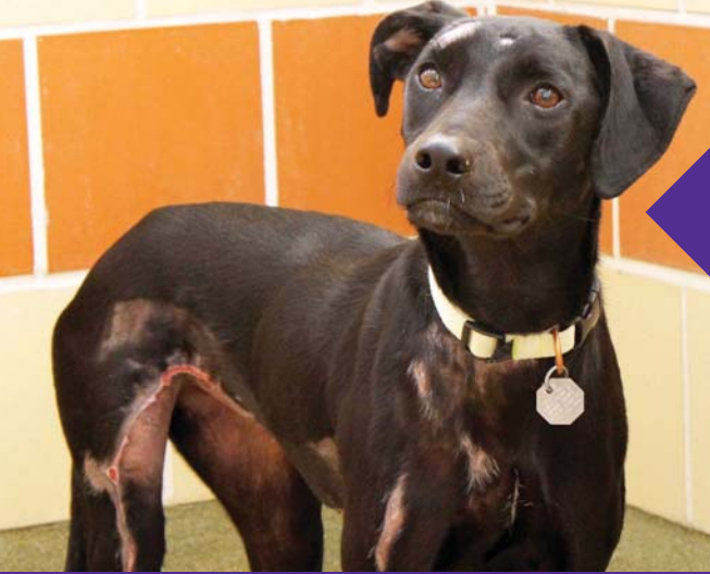
Delilah at the SAHS in December 2013