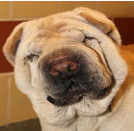
Sesame before & after surgery