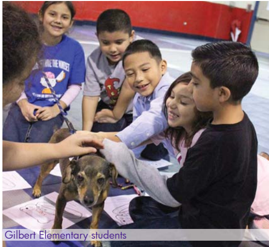
Gilbert Elementary students