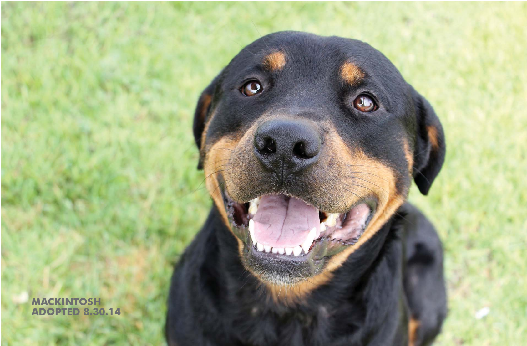
MACKINTOSH ADOPTED 8.30.14