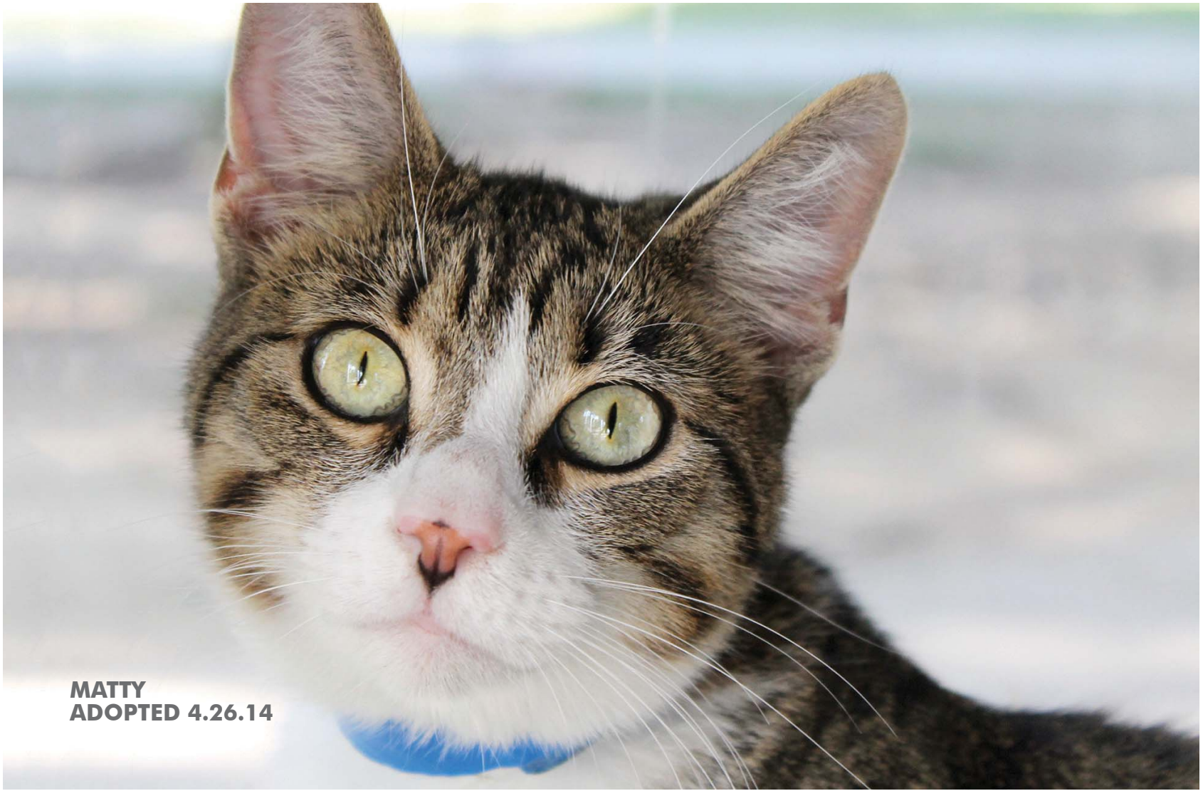
MATTY ADOPTED 4.26.14