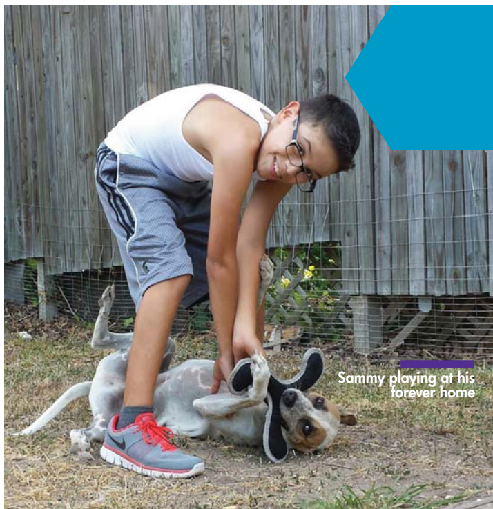
Sammy playing at his forever home