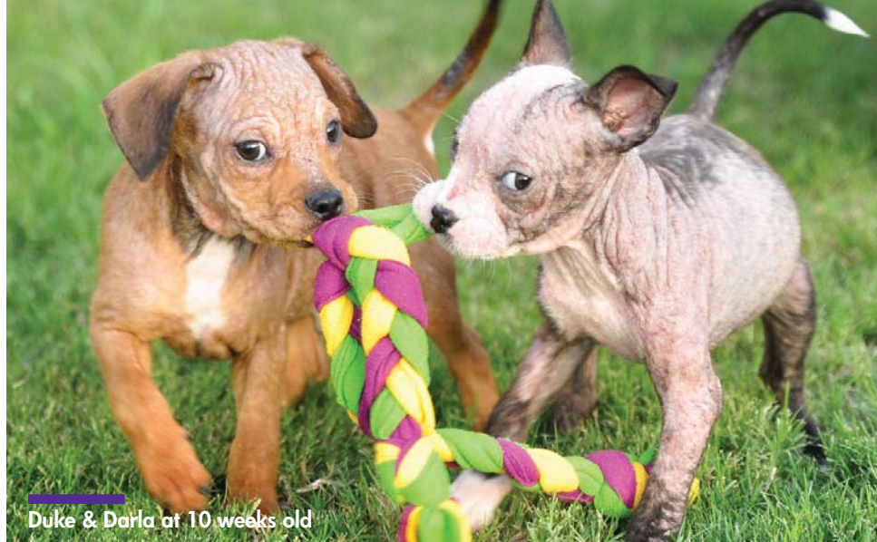
Duke & Darla at 10 weeks old