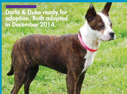
Darla & Duke ready for adoption. Both adopted in December 2014.