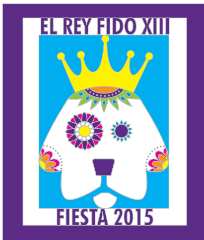
A sneak peak at our 2015 ERF Fiesta medal, available to purchase at the SAHS & Fiesta® Store soon!

The 2015 El Rey Fido fundraising deadline is Thursday, March 19 th (cash donations must be turned in to the SAHS by 6pm and FirstGiving donations must be complete by 10pm). Find out more and review our El Rey Fido rules at SAhumane.org/ERF.